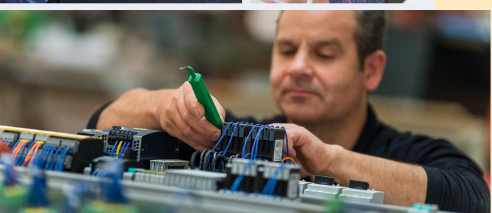
We push on where others stop – with training, networking and research.